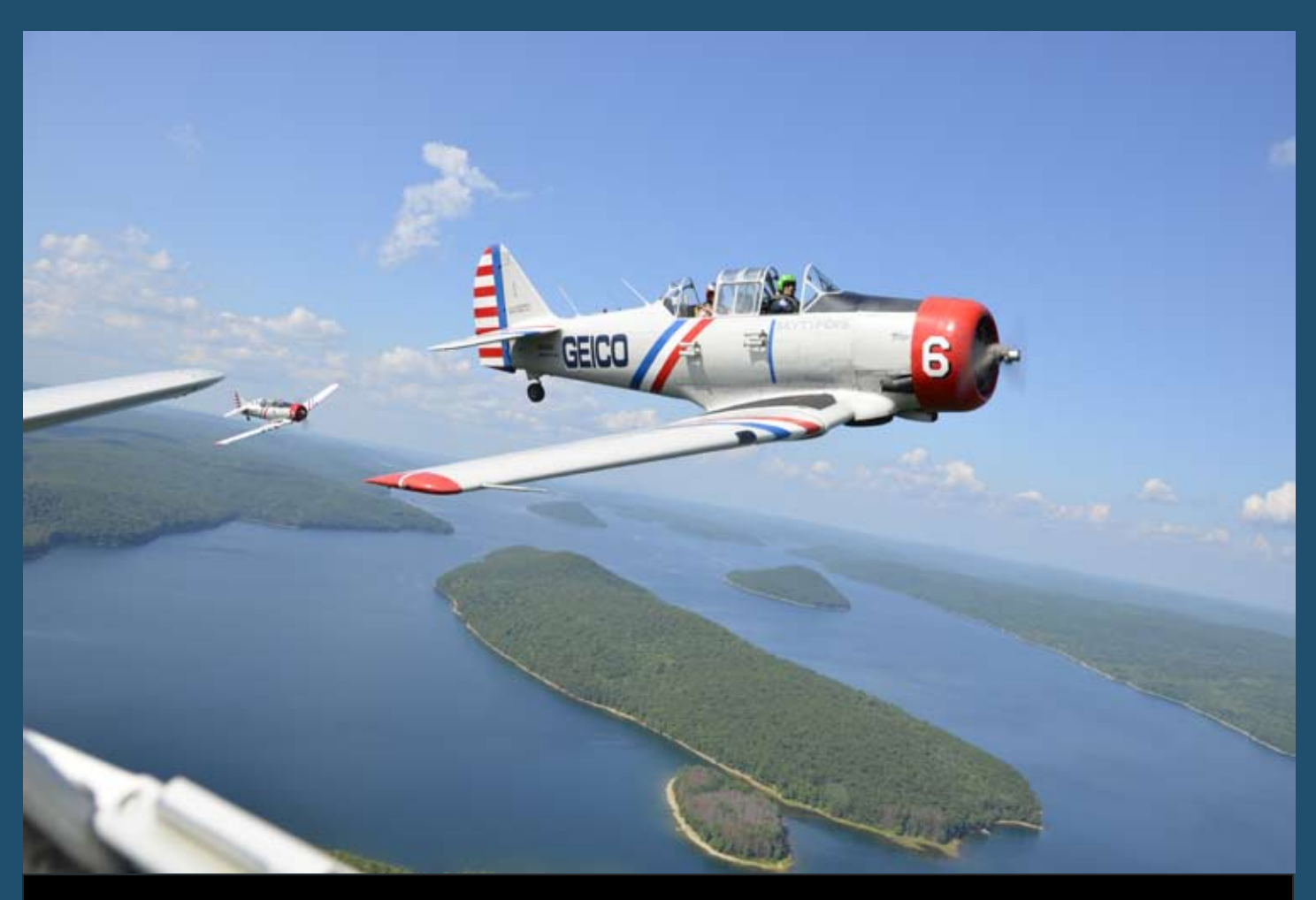
QUABBIN VIEW >> Flying in formation above the Quabbin Reservoir in Belchertown, Mass., six World War II SNJ-2 trainers prepare for the Aug. 4-5 Great New England Air Show and Open House. These aircraft comprised the Geico Skytypers, one of several civilian performers at the show. More photos of the air show are on pages 8-11.