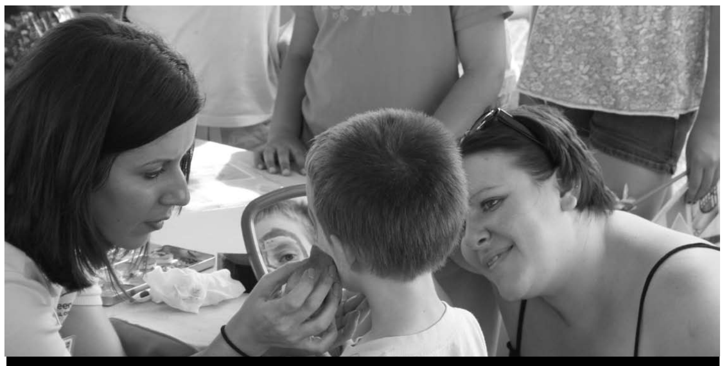
FAMILY FACES >> Family Day face painting was among the many activities offered Aug. 8 on the Base Ellipse. Nearly 4,000 family members and reservists attended the event.