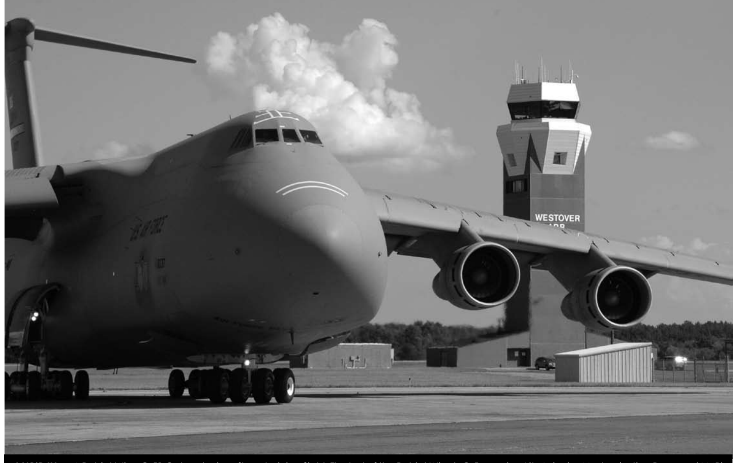
AMP'D IN >> A Patriot Wing C-5B Galaxy taxies after a training flight. The last of the Patriot Wing's C-5s received its Avionics Modernization Program (AMP) and returned to Westover from Travis Air Force Base, Calif., Aug. 25. The near two-year project involved extensive training for Westover's aircrews and maintainers.