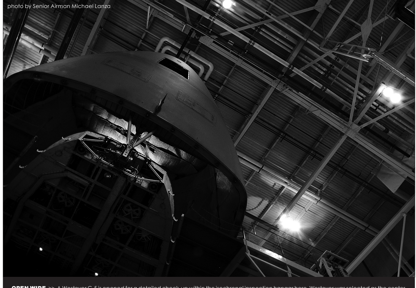
OPEN WIDE >> A Westover C-5 is opened for a detailed check-up within the isochronal inspection hangar here. Westover was selected as the center for Reserve ISO inspections during an announcement Dec. 13 in which the Air Force unvieled plans to consolidate its ISO facilities.