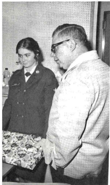
at Newington Children's Hospital food holds her gift.