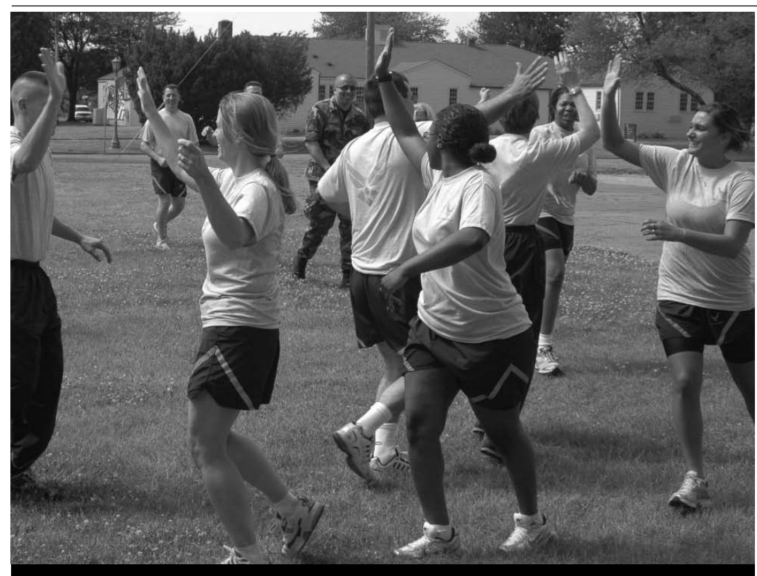
HIGH FIVES >> Team-building exercises like this one were part of the third annual enlisted workshop held after the June A UTA. The workshop, held at the conference center, included career and deployments. Wing leadership is already planning another workshop for June 2010.