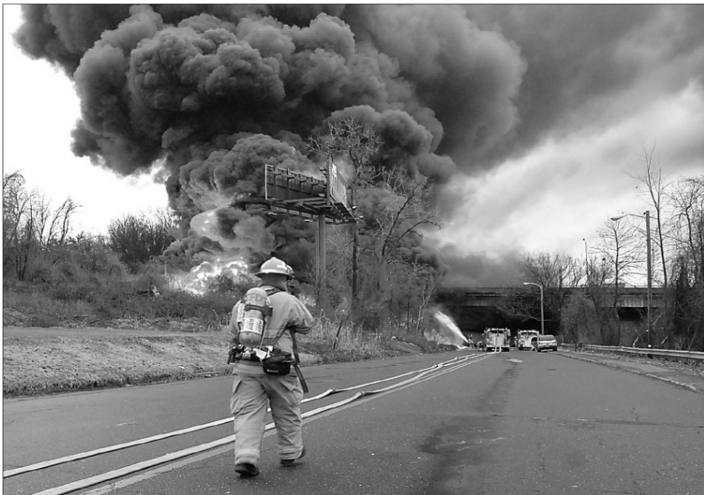
ANSWERING THE CALL >> Westover firefighters respond to the March 28 tanker explosion near Interstate 91. Westover crews directed a special foam from a one of the trucks that put out the flames in a matter of minutes. The tanker truck had been hauling over 10,000 gallons of jet and diesel fuel.