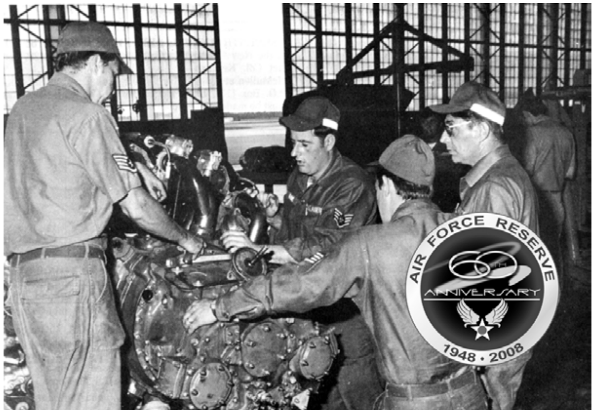
ENGINEITY >> Westover reservists gather around a C-123 Provider engine in this 1975 photo from the Patriot archive. These reservists were members of the 901st Consolidated Aircraft Maintenance Squadron, which maintained both the C-123s and C-130 Hercules transports assigned to the base. Westover was home to the Providers from 1973 to 1982, and hosted the Hercules from 1972 to 1987.