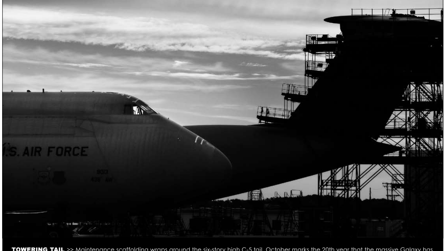
TOWERING TAIL >> Maintenance scaffolding wraps around the six-story high C-5 tail. October marks the 20th year that the massive Galaxy has made its home at Westover. Sixteen of the Air Force's largest aircraft are flown here by the 337th Airlift Squadron.